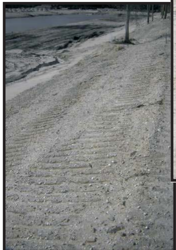
March 23, 2004