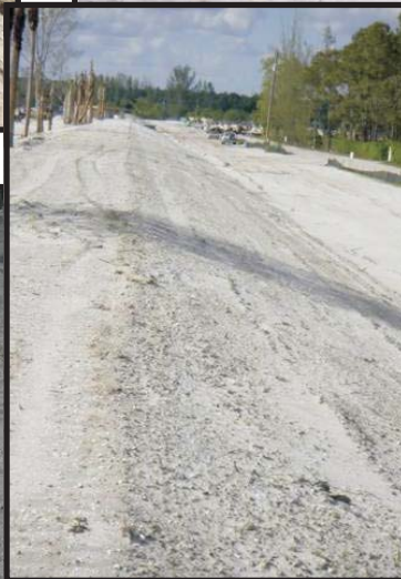
April 18, 2004