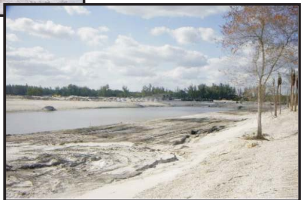
May 30, 2004

Prior to our LDC Application some of the erosion ruts were over 12" deep. The ground slopes were dressed with a dozer and the LDC was spray applied at a rate of 55 gallons per surface acre. Total Rainfall during this period was 6.5 inches.